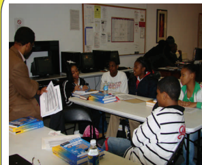
Teens at Entrepreneurship class last year.